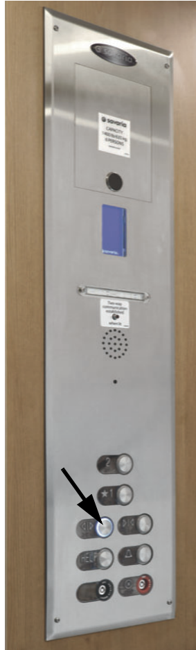
Figure 3 Door Open Button

When the elevator is at a landing level, the doors can be opened by pressing the Door Open button. Normally the doors will have opened and already closed automatically. The Door Open button allows the door to be reopened.