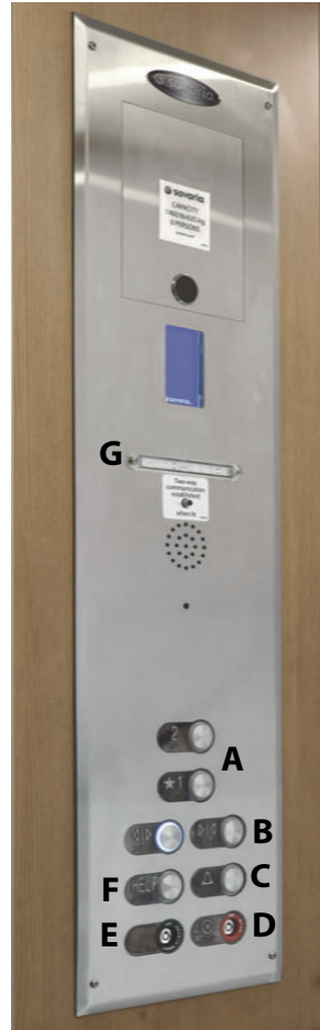
Figure 1 Keyped COP

This button can be pressed at any time to activate the optional hands-free phone in case of an emergency. The red light above the speaker will come on when two-way communication has been established. For units that have a standard hand-held phone, it is located in a separate phone cabinet in the cab.