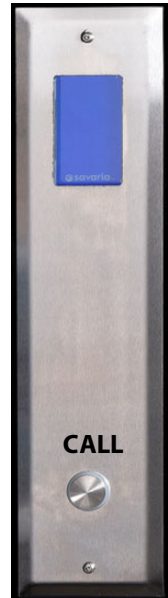
Figure 2 Hall Call Station

In the event of a building power failure, the door system is provided with a temporary power back-up system to continue the opening operation for a number of times. On resuming normal building power, the back-up system will turn OFF and begin automatically recharging.