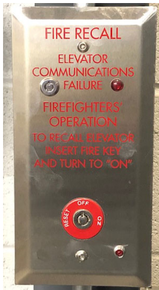
Figure 3 Phone Monitor

NOTE: There is an alarm silence key provided to turn off the beeper.